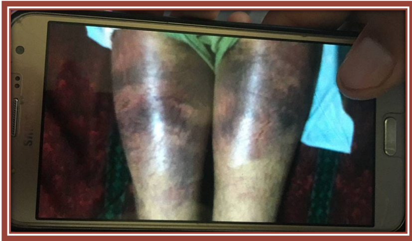
A victim of torture shows the images of his different body parts brutally tortured by Indian military forces.

Sometimes torture is simply used as a punishment that spreads fear in society. There are varied forms of torture including physical nature, like beatings and electric shocks. It can be of a sexual nature, like rape or sexual humiliation. 27 Or they can be of a psychological nature, like sleep deprivation or prolonged solitary confinement. Torture qualifies as a war crime as per the International Criminal Court (ICC) and the Geneva Conventions. 28 Torture has a long history in J&K, with documentation over the past three decades by the International Committee of the Red Cross (ICRC) (US Embassy-New Delhi, ICRC frustrated with Indian Government (6 April 2005), 29 the United Nations and various international and local organizations. 30 Such concerns have become even more urgent following the August 2019 lockdown and the increased restrictions on movement and communications. Despite the