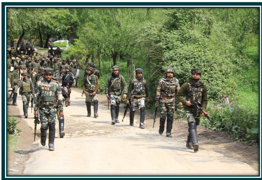
Indian military forces march towards a village for a Cordon and Search Operation (CASO).