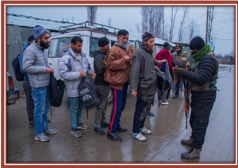
Indian military frisking local Kashmiri's in the outskirts of Srinagar, summer capital of the region.

Besides frisking, other additional measures including speculative CASOs, phone prying, checking mobile VPNs, roadside searches and electronic surveillance has been deployed to ‘maintain the peace as claimed 10 by a senior police officer. While quoting senior police officer Greater Kashmir reported 11 that “in Srinagar, extra-check points manned jointly by police and CRPF have been established at several places. At checkpoints, traffic movement is monitored very closely. We have been carrying speculative CASOs besides the frisking of vehicles at various places. The additional measures include surprise check posts and limited Cordon and Search Operations (CASO) in crowded places to keep terrorists at bay.”